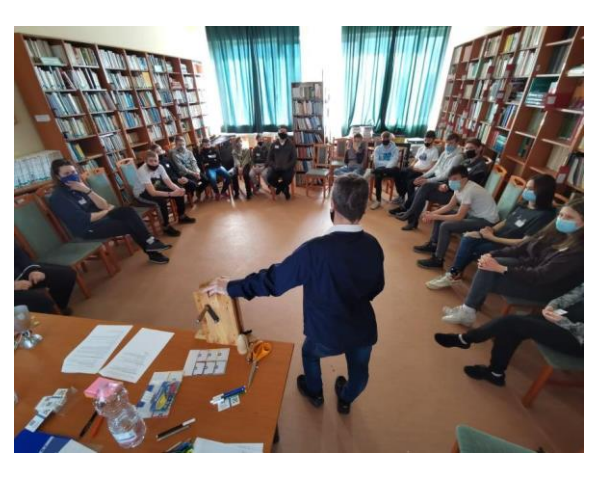
Expert by experience speaks to a class in Hungary

The experience of the data collection shows that it is very important for school-age children to meet people with disabilities as early as possible in their education. Learning about the life situations, challenges and successes of people with disabilities is essential for students to become more accepting, whether with their classmates/peers or later with any member of society. By involving qualified experts with experience, we enable students to engage