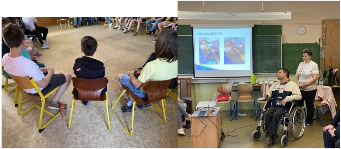
Workshop sessions with experts by experience on primary school in Hungary

out and think about whether they would write something else. If you wish, you can discuss the key lessons together.