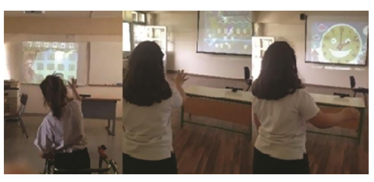
Image obtained from Kosmas, Ioannou and Retalis (2017)<sup>4</sup>

Under the lens of Embodied Cognition theory, Embodied Learning emphasizes on the inseparable link between brain, body and the world. Embodied Learning considers that the active human body can alter the function of the brain and therefore the cognitive process. The exploration of learning environments that promote bodily