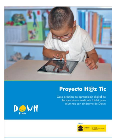
Frontpage of H@z Tic project guidelines

Down Spain is an organization that has been working for more than 30 years for the inclusion of people with Down Syndrome in society, in each of the stages of their life cycle. Since training is a determining factor in the integral growth of any person, this entity launched the "H@z Tic" Project in the 2011-2012 academic year, Initiated in educational centres of 5 Spanish Autonomous Communities, the Project is based on the use of technologies such as tablet-PCs , due to how easy and intuitive it is to use, which seeks to minimize the difficulties inherent in the integration of students with Down Syndrome in the classroom through the traditional methodology. It is the first to investigate the possible benefits that such technologies can have for people with Down syndrome. In addition, by involving