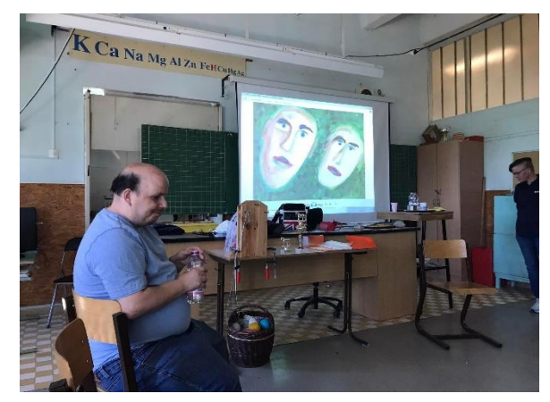
Expert by experience shows objects and discusses with children.

They always use visual and physical resources to introduce each area: personal photos, videos, and often work-related or personal objects that are helpful, but also objects that show some achievement or pride in something are common (medal, trophy, diploma, certificate, etc.). It