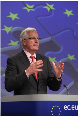
Commissioner M. Barnier in charge of Internal Market and Services

EASPD and its Policy Impact Group will assess the directive in detail and it will contribute actively to the debate.