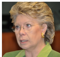
Vice-president and commissioner responsible for justice, fundamental rights and citizenship.

with disabilities that can supply them with expertise, knowhow and sensitiveness. Services providers for persons with disabilities should rely on sustainable and predictable legislation and financial resources in order to play their role in an effective way, consequently enabling users to enjoy full rights as citizens in the society. Service providers can support authorities in achieving these goals, by creating agencies, working in close cooperation with persons with disabilities to provide expertise on accessibility (physical accessibility, e-accessibility, assistive technology...).